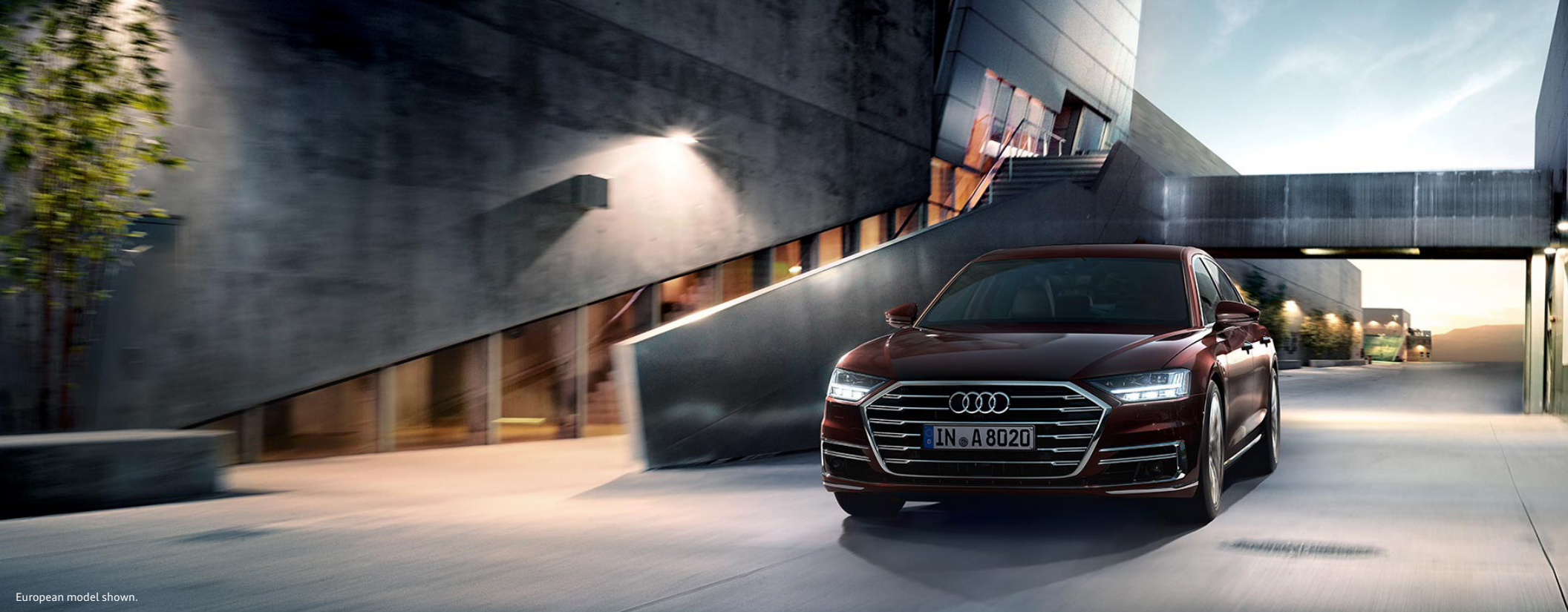
European model shown.